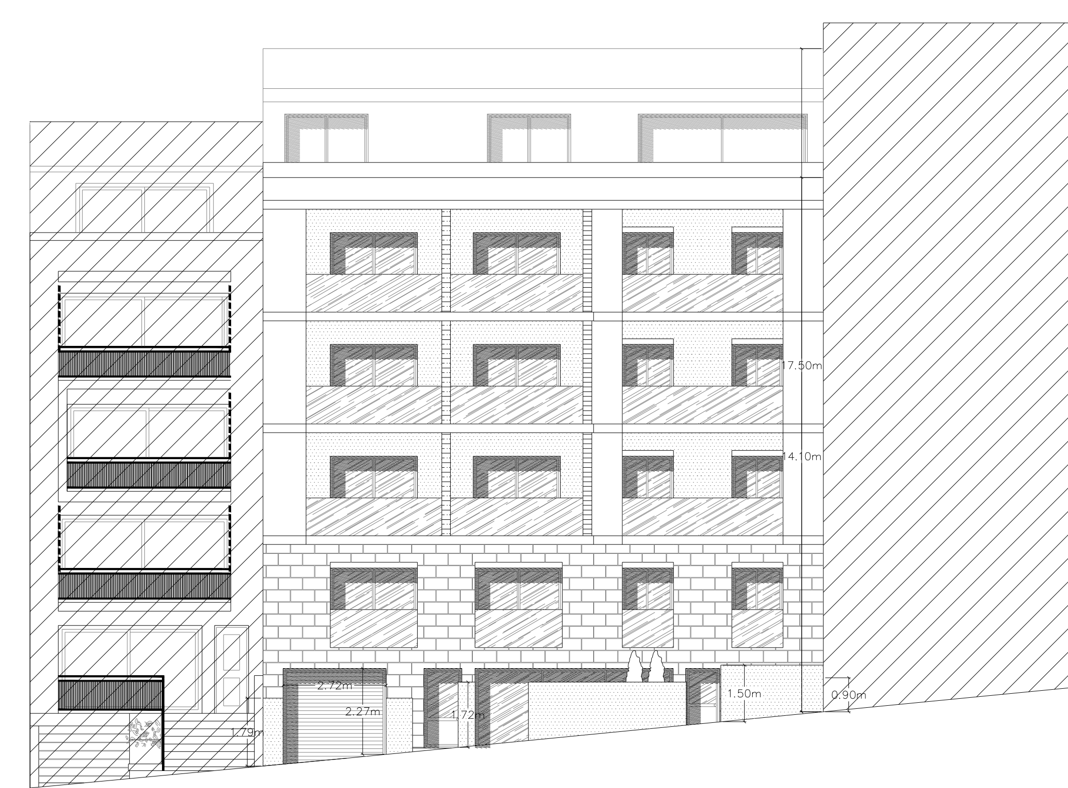
Proposed streetscape elevation Scale 1:100 clean copy