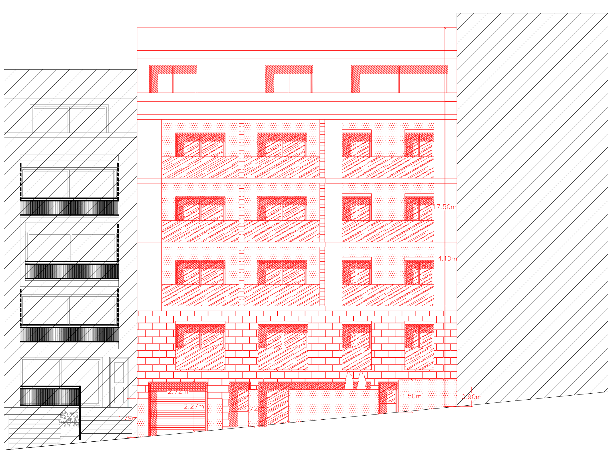
Proposed streetscape elevation Scale 1:100